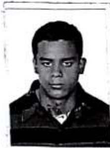
Nawab Shah Alam Khan College of Engineering & Technology New Malakpet, Hyderabad-500024

Enclosed Undertaking of fine for missing photo