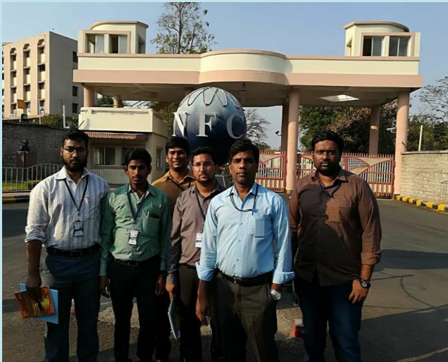
In Front of NFC Entrance Gate

as a nuclear plant also specializing in supply of nuclear fuel bindles and reactors core components. It is a unique facility where natural and enriched uranium fuel, zirconium, alloy cladding and reactor core components are manufactured under one roof.