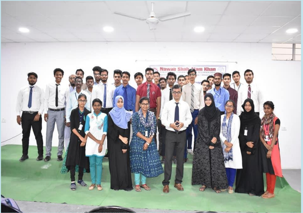
7th days Training for Task Mahendra Pride Programme with Collaboration with Mahindra & Mahindra