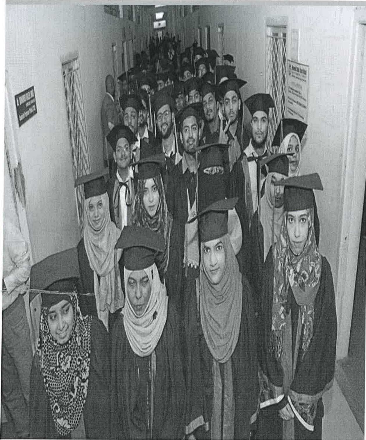
Batch of 2015-2019

Affiliated to OU | Approved by AICTE | Accredited by NAAC | Permitted by Govt. of TS | Included in 2F UGC | Registered with TASK | Cisco Networking Academy 16-4-1, New Malakpet, Hyderabad, TS-500024. E-mail: nsakcet@gmail.com , website: www.nsakcet.ac.in