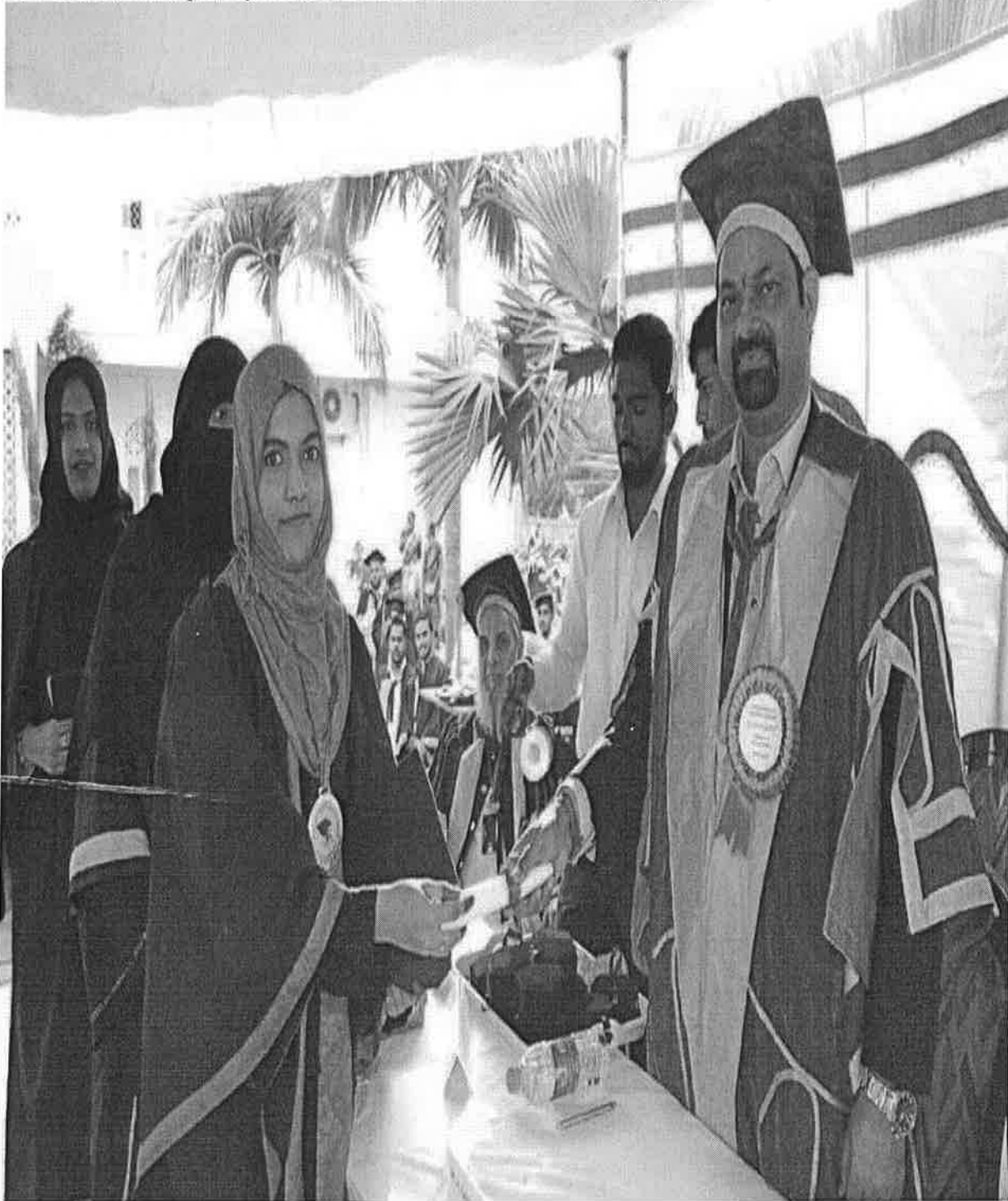
Certificate given to student by chief guest

Affiliated to OU | Approved by AICTE | Accredited by NAAC | Permitted by Govt. of TS | Included in 2F UGC | Registered with TASK | Cisco Networking Academy 16-4-1, New Malakpet, Hyderabad, TS-500024. E-mail: nsakcet@gmail.com., website: www.nsakcet.ac.in