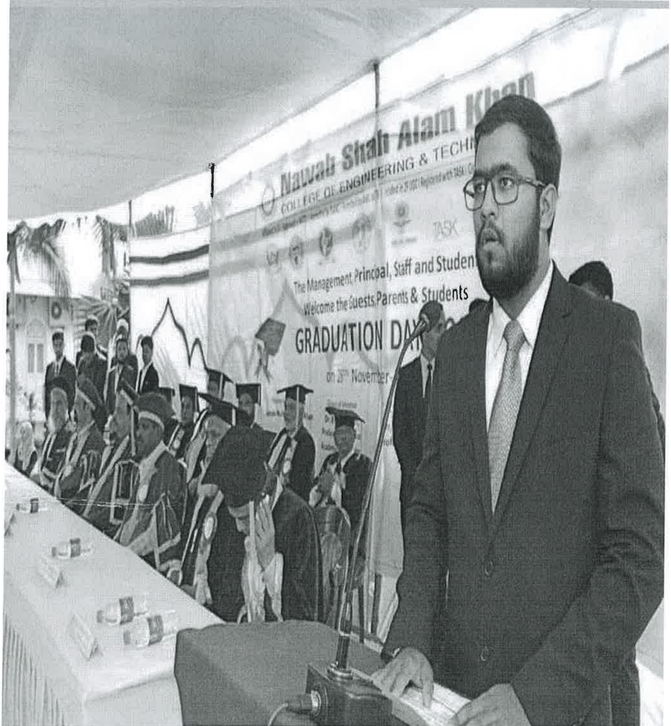
Speech given by a student

Affiliated to OU | Approved by AICTE | Accredited by NAAC | Permitted by Govt. of TS | Included in 2F UGC | Registered with TASK | Cisco Networking Academy 16-4-1, New Malakpet, Hyderabad, TS-500024. E-mail: nsakcet@gmail.com., website: www.nsakcet.ac.in