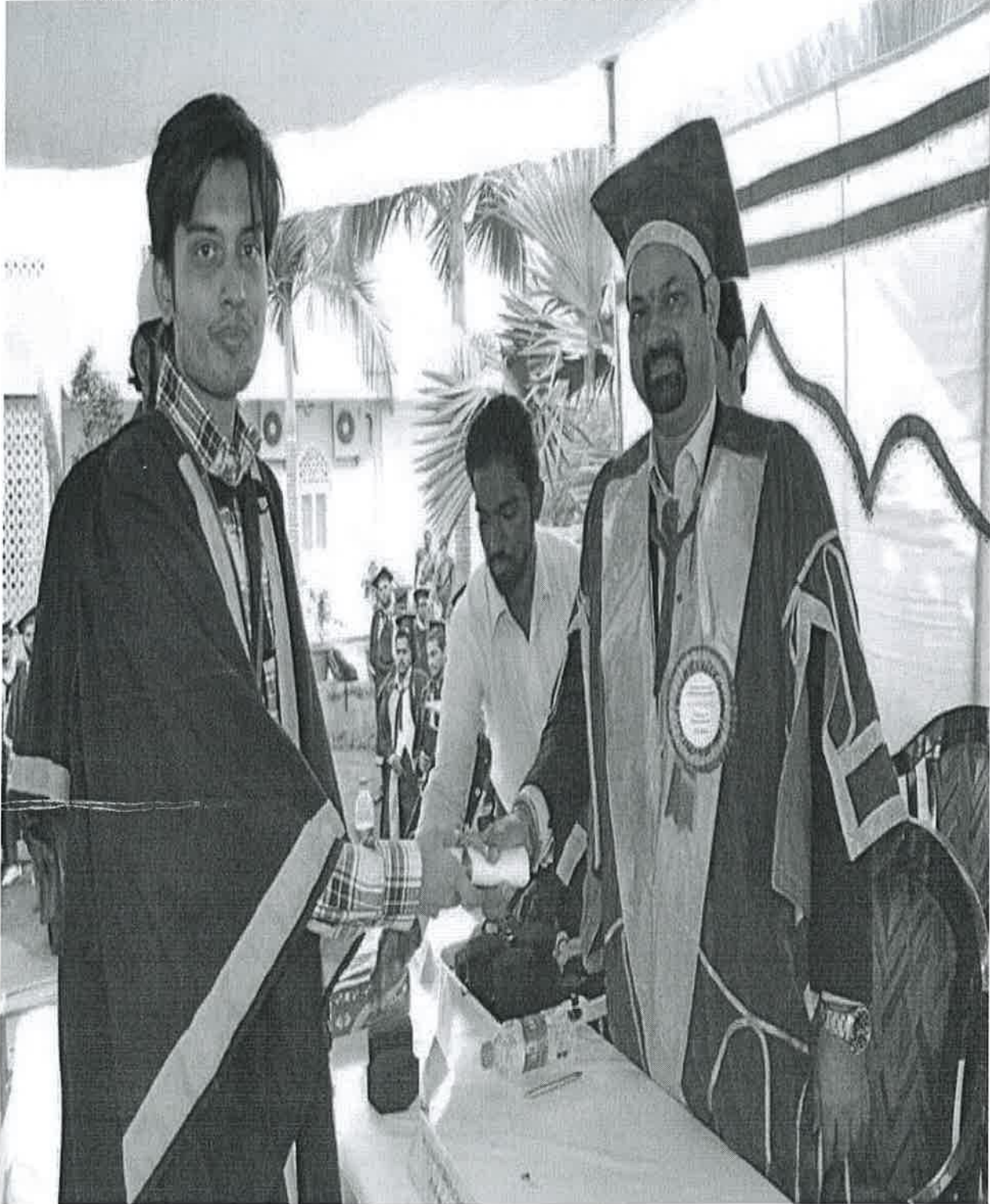
Certificate given to student by chief guest

Affiliated to OU | Approved by AICTE | Accredited by NAAC | Permitted by Govt. of TS | Included in 2F UGC | Registered with TASK | Cisco Networking Academy 16-4-1, New Malakpet, Hyderabad, TS-500024. E-mail: nsakcet@gmail.com., website: www.nsakcet.ac.in